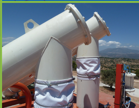
Cement screw conveyors