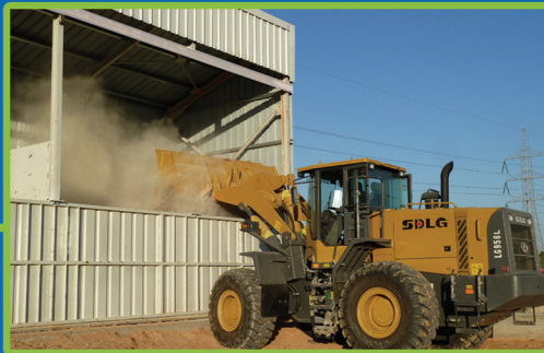
Loading of aggregate