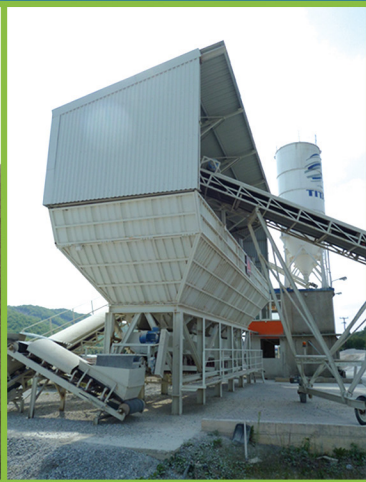
Aggregate preloading conveyor belt