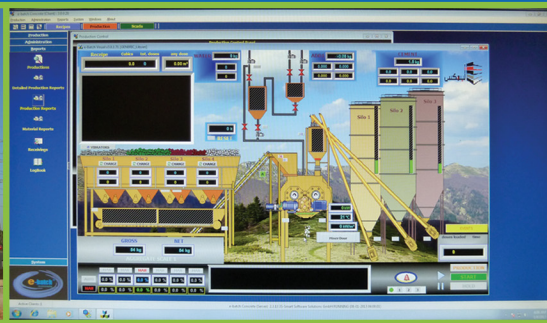
Special production software